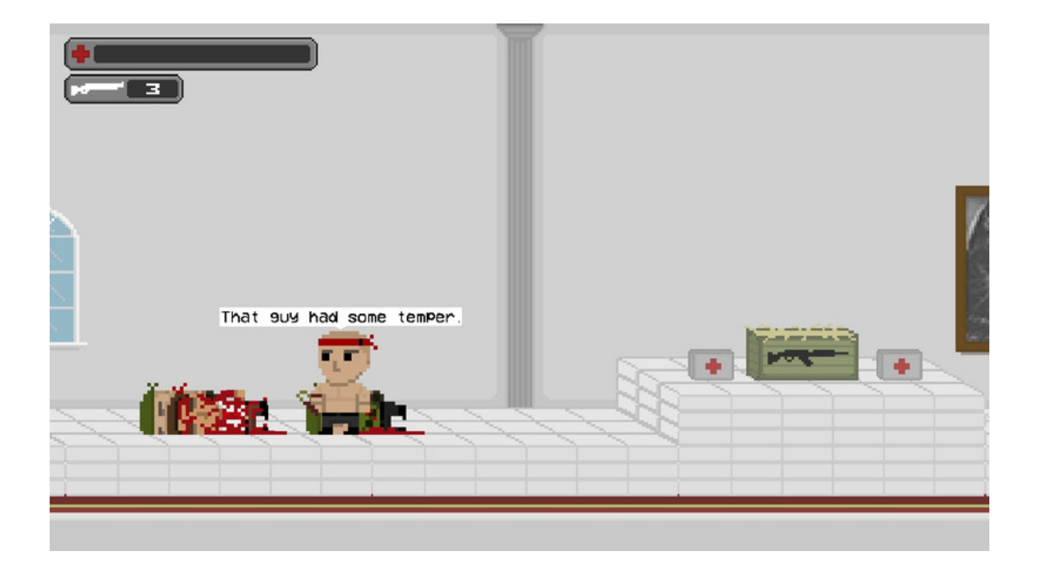
Lock Her Up: The Trump Supremacy Patch 8 Download Pc